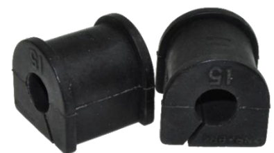
A pair of Comline Stabiliser mounts

For more information on Comline steering & suspension or for any queries regarding this change please contact your Comline Sales Manager on +44 (0)1582578888 or alternatively contact the Product Team at pdd@comline.uk.com